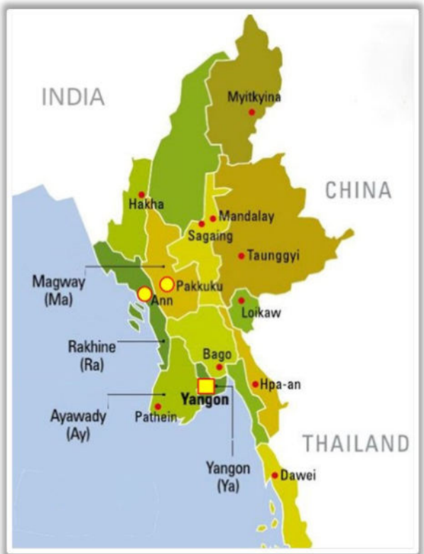
Our working areas: Yangon, Ann (Rakhine State) and Pakokku (Magway Region)