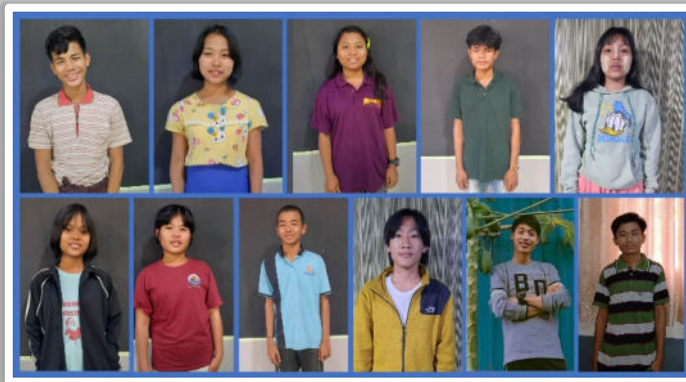
Support of students

In 2024, we will support more students and also young people in vocational training.