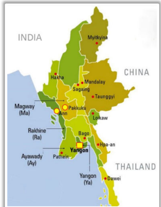
Our areas of work: Yangon, Ann (Rakhine State) and Pakokku (Magway Region)

The difficulty for our team is that since November 2019, we are not able to visit the people in Myanmar to train and encourage project leaders. How things will continue under the current political situation remains open.