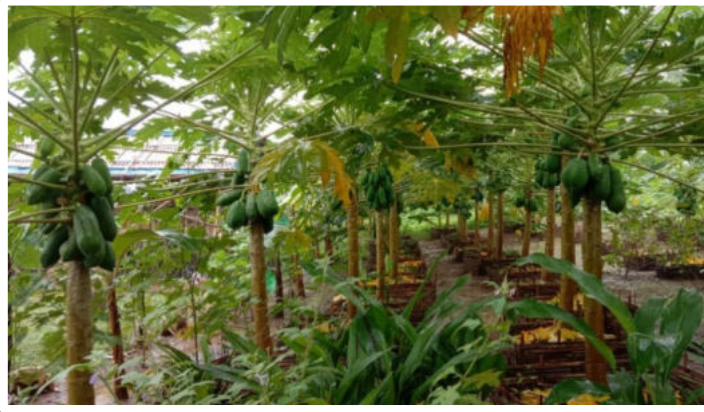
Papaya plantation of Law Rein in Rakhine