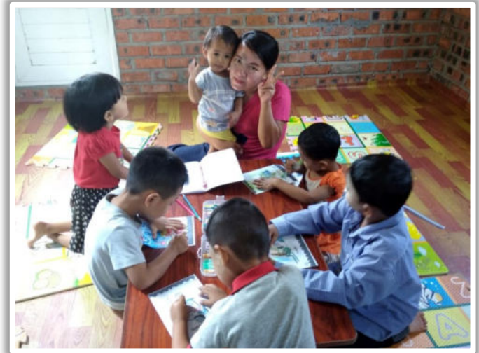
Preschool of Huai Huai in Yangon

In 2020 our broad portfolio included a total of 99 projects, of which 13 had been successfully completed and 11 new ones had been approved.